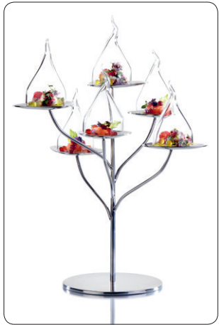
The mini cloches items 4982... are available in our main catalogue on page 174