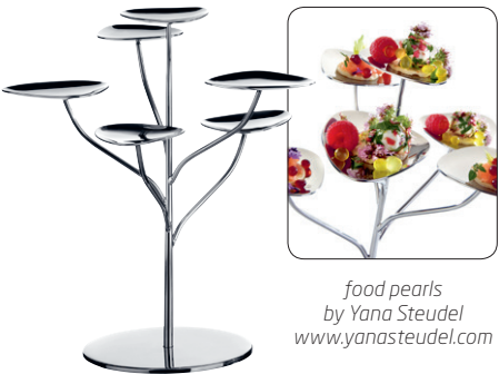
food pearls by Yana Steudel www.yanasteudel.com