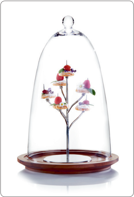
The cloche item 4852 and the matching coaster made from walnut wood item 4734.03 are available in our main catalogue on page 177